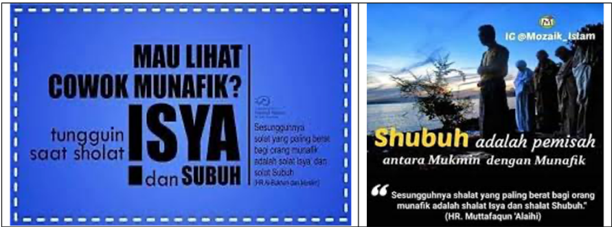
Figure 10. Simplification and labeling of men who do not pray Isha and Fajr as hypocrites

c) In turn, memes like the congregational dawn prayer above imply some simplification and contradiction. For example, the following memes provide a clear evidence of the existing forms of simplification.