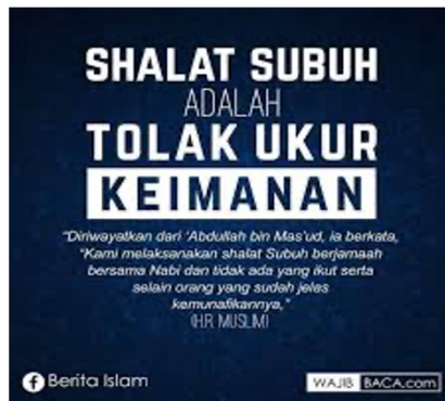
Figure 7. Congregational Dawn Prayer as a standard measure of faith

The currently circulating memes on social media platforms, such as Instagram and Facebook, mostly concern with the current movement for performing the Congregational Dawn Prayer at the mosque. The meme above represents those circulating on many Instagram accounts. These memes highlight that the Congregational Dawn Prayer at the mosque is one of the benchmarks for one's faith as mentioned in the following meme: