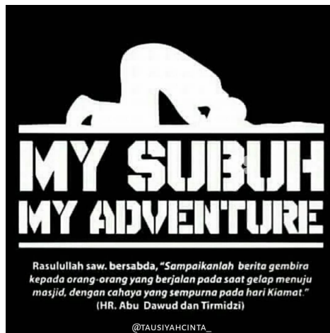
Figure 9. Condensing the meaning of the hadith text

a) The condensation of meaning, which refers to the attempt to briefly summarize the meaning of hadith text, and even reducing its essential meaning. The condensation of meaning arises when a hadith is reproduced in the form of a meme.