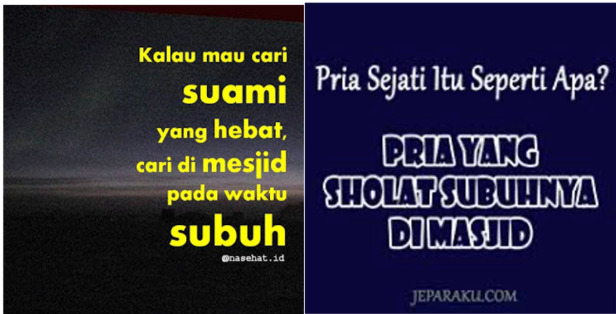
Figure 8. Praise and compliments for the dawn fighters

and they are labeled as a devout Muslim. The devout label attached to these people are attributed to two factors. First, the Dawn fighters are known with their innumerable rewards for performing Congregational Dawn Prayer at the mosque which is similar to carrying out night prayers throughout the night. Allah has assured the piety of these people and the fact that they are not classified as hypocrites. Second, those who perform the Dawn Prayer are included in the special group of Muslims, since many people will pray them for their future sustenance and soulmate. For certain groups, these two characteristics serve as the standard for finding an ideal and true husband (see picture below).