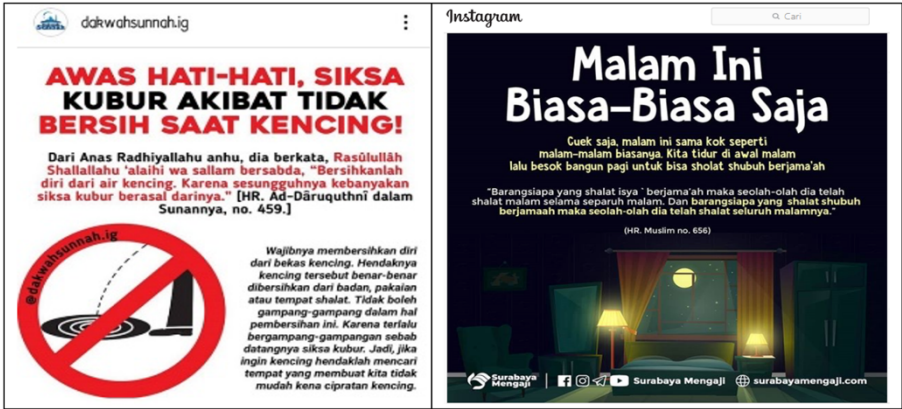
Figures 5 & 6. Captions, images and Coloring featured in the hadith meme

In principal, the descriptions in table 2 are similar to table 1, but the stark difference lies on the highlighted reception and interpretation of the hadith narratives as presented in the following memes.